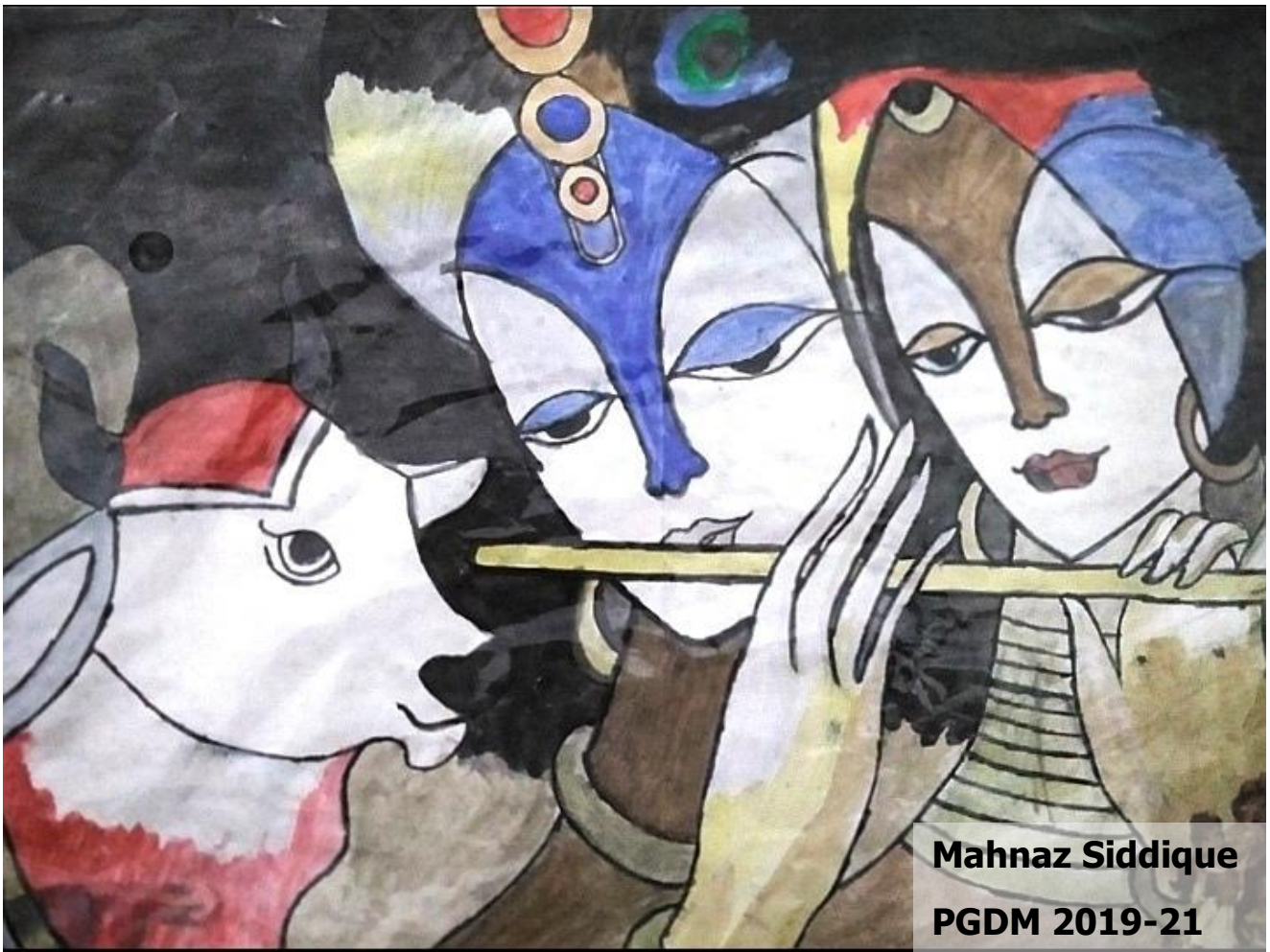
Mahnaz Siddique PGDM 2019-21