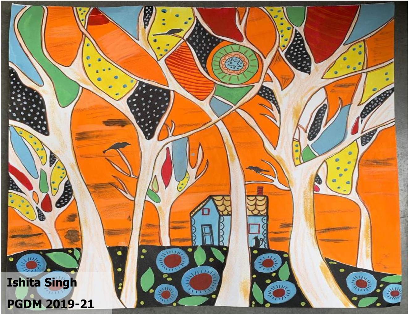
Ishita Singh PGDM 2019-21